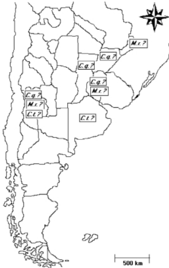
Figure 1. Introduction of crustacea with culture purposes C.q.: Cherax quadricarinatus , C.t: Cherax tenuimanus , M.r. Macrobrachium rosenbergii . Date and exact location of introduction unknown