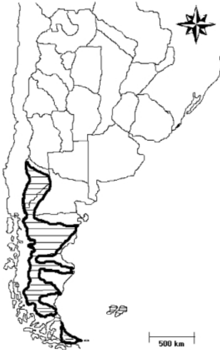
Figure 10. Known distribution of Salvelinus fontinalis . (Modified from Baigun & Quiros 1985; Pascual et al. in press; Vigliano & Alonso in press.)