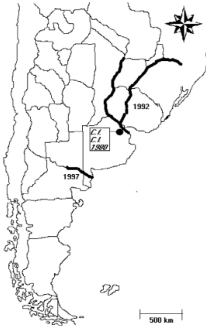
Figure 3. Known distribution of C.f.: Corbicula fluminea , C.l.: C. largillierti . 1980 year of first detection.