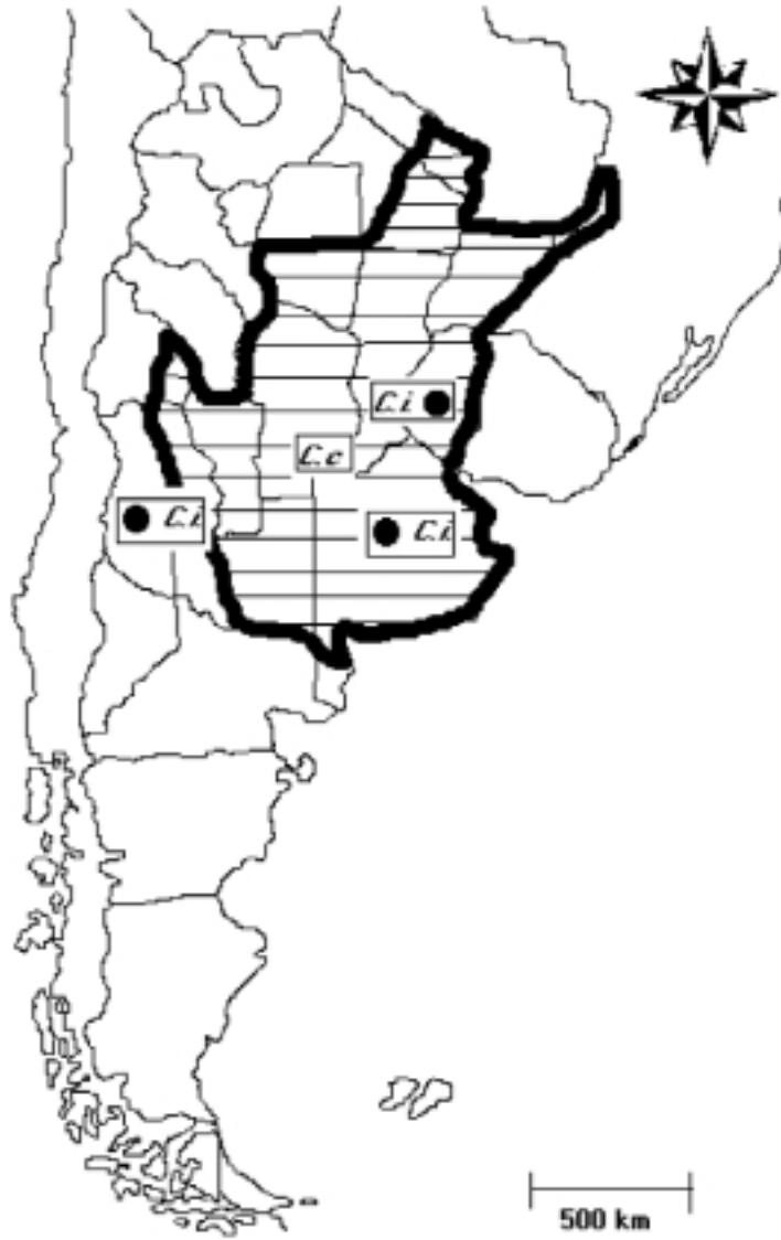
Figure 5. Know distribution of C.c.: Cyprinus carpio , C.i.: Ctenopharingodon idella .