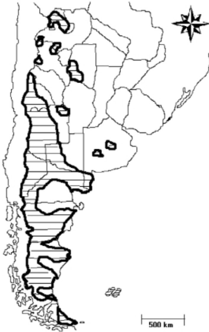
Figure 8. Known distribution of Oncorhynchus mykiss . (Modified from Baigun & Quiros 1985; Pascual et al. in press; Vigliano & Alonso in press.)