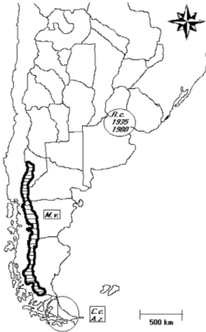
Figure 11. Known distribution of R.c. : Rana catesbiana , M.v. : Mustela vison , C.c. : Castor Canadensis and O.z. : Ondatra zibethicus .