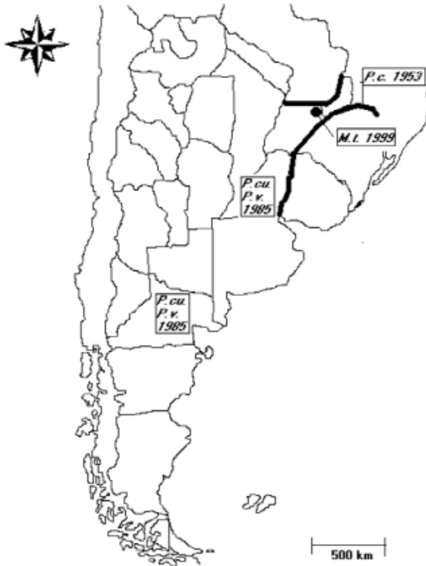
Figure 2. Report of presence of alien gastropoda on river systems M.t. : Melanoides tuberculata , P.c. : Pseudosuccinea columnella , P. cu. : Physella cubensis , P.v. : Physella venustula . 1953 : year of first detection.